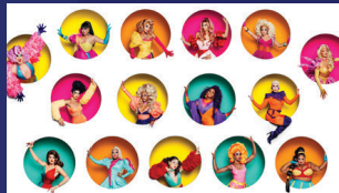
Ru Paul's Drag Race